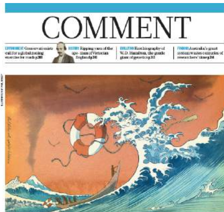
Sustainable development goals for people and planet